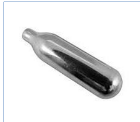
A nitrous oxide canister