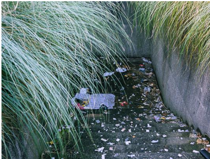
Drug litter found near Six Dials, photos courtesy of Nigel Brunson. Injecting Advice.com