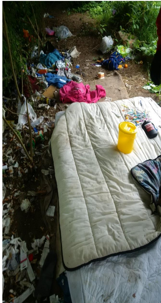
Bevois Ward - Southampton