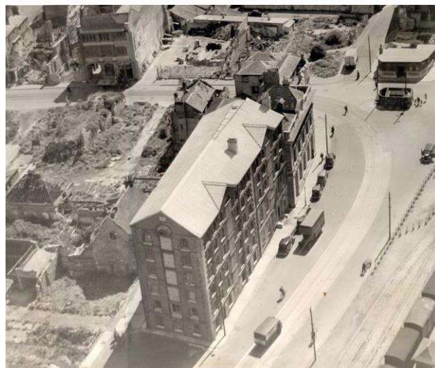
Site of Town Quay Park – Post War

Surrounding the Park are reminders of its older history. At the High Street end lie remains of a Saxon rampart, defensive walls and gates, medieval wine vaults and the striking ruins of 'Canute's Palace' and 'Quilter's Vault'. At the opposite end sits the medieval Wool House. As well as storing wool, on which Southampton's wealth-generating trade was based, the Wool House also housed French prisoners during the Napoleonic wars.