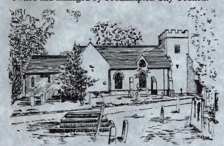
St Mary's Grade I Listed Building

The area has a number of different landowners who also manage the land. For example, the Lower Itchen Valley Nature Reserve is owned and managed by Eastleigh Borough Council and Riverside Park is owned and managed by Southampton City Council.