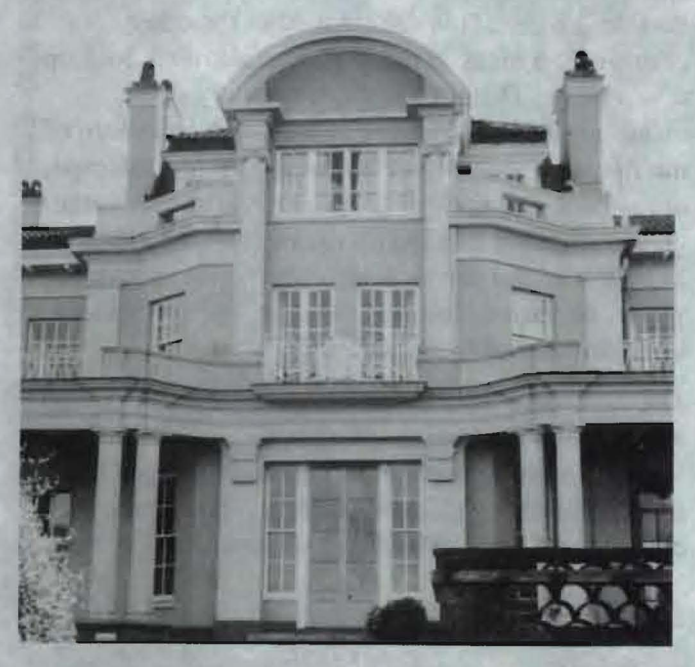
Townhill Park House Grade II Listed Building