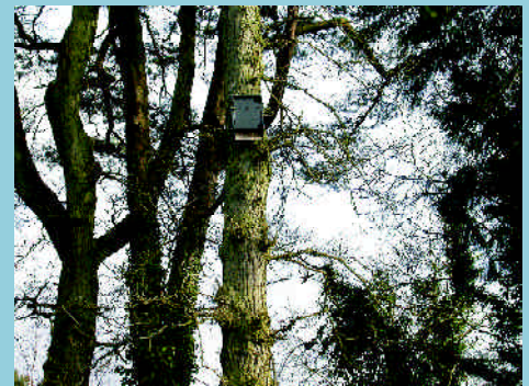
Bat boxes, in this case for the brown long-eared species, should be provided as compensation for the loss of existing bat roosts on a development site