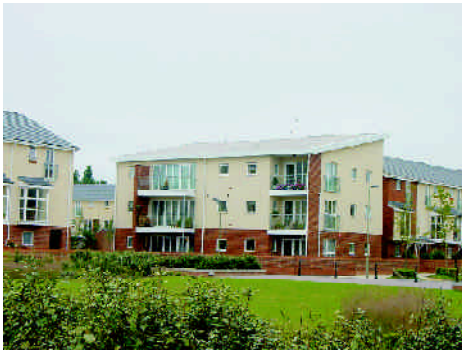
Public space should be overlooked by adjacent housing - Hythe