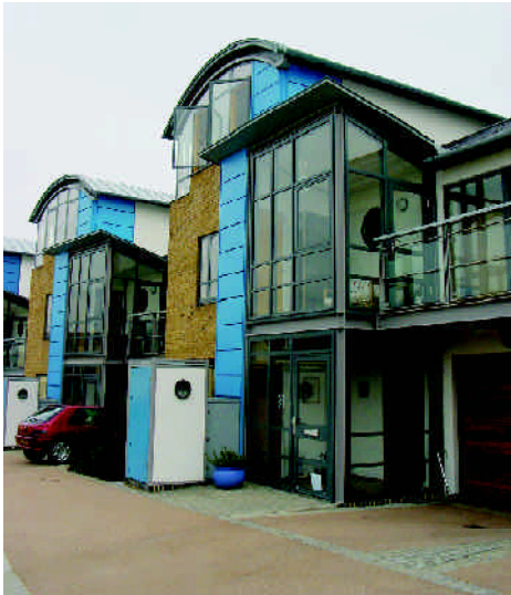
The threshold space clearly defines the public realm from the private defensible space - Harlow