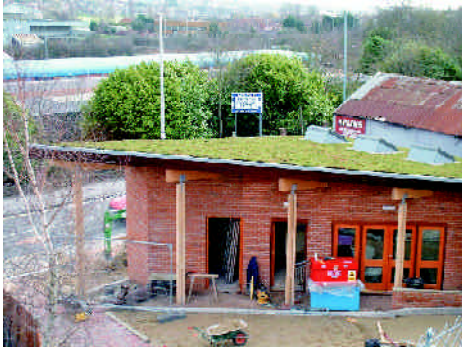
The use of a green roof provides a place for biodiversity and habitat creation