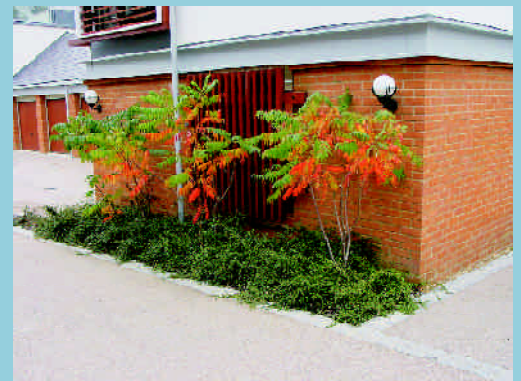
Small planting beds should be of sufficient size to allow shrubs to establish. The use of shrubs that have variety in colour all year and colours that complement building materials is encouraged - Harlow