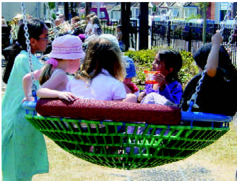
A local neighbourhood play space at Northam Home Zone, Southampton