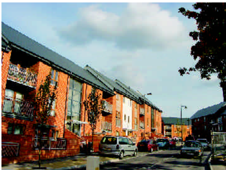
Balconies inset behind the building line offer a sheltered amenity space and sun catch - Basingstoke