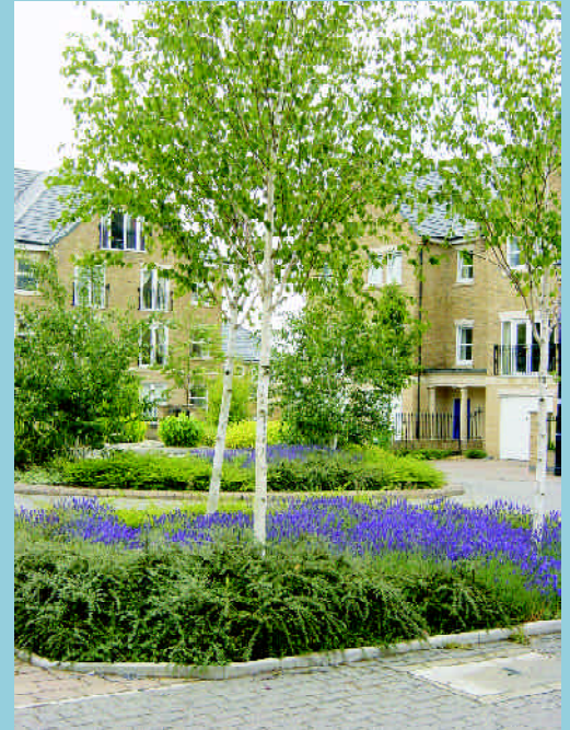
A high quality landscape scheme. Trees should have a girth of 14-16 cm and should be adequately staked to prevent vandalism - Southampton