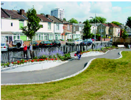
A new 'pocket park' has been created on previously derelict and under-used land - Northam Home Zone, Southampton