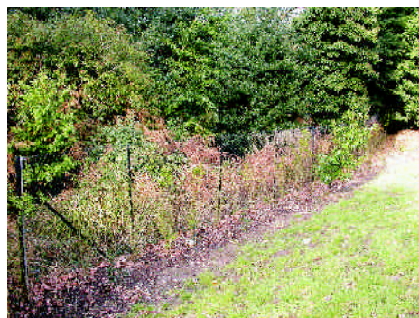
Suitable protection, such as this chain link fencing, should be installed on a site to protect existing habitats, such as badger setts and 'badger corridors' to facilitate movement