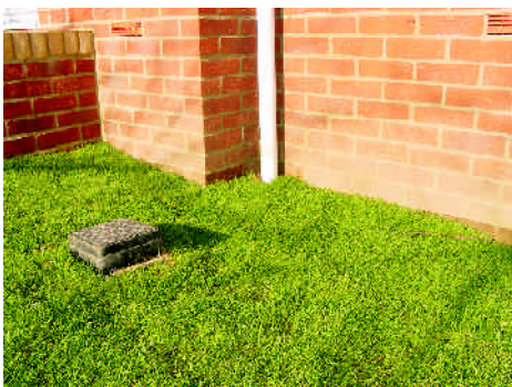
Access covers and manholes should be laid level with surrounding ground levels to facilitate easy maintenance of lawns