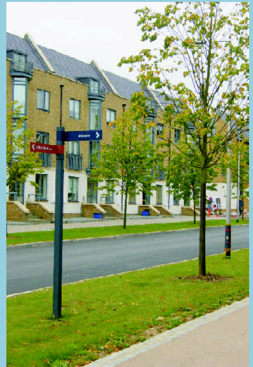
These town houses have no private soft landscape space in their front curtilage; instead an attractive boulevard of street trees has been planted - Harlow

4.2.4 The pressure for development often places housing near to noise sources such as transportation, industry and commerce. Potential noisy impacts must be assessed in accordance with appropriate guidance and standards, which may require some change in design or mitigation of the development. Where design or mitigation cannot be carried out, the development may be deemed to be inappropriate for housing.