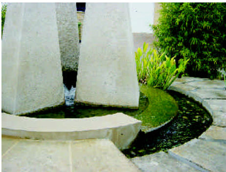
A public art feature provides a focal point in a courtyard at Northlands Road, Southampton