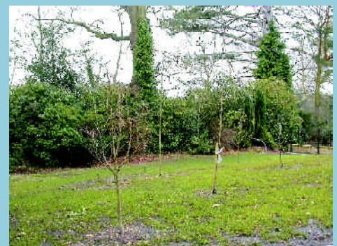
A 'badger orchard' has been provided on this site as a source of food for the badgers and rotting fallen fruit to encourage earthworms and insect larvae, which also form part of the badger's diet