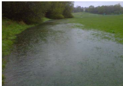
Photo 1: Surface water flooding during a heavy rainfall event (25 th April 2012)