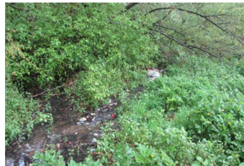
Photo 2: Surface water runoff during a moderate rainfall event (10 th May 2012)