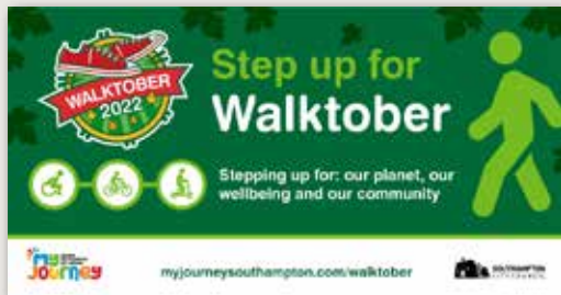
Social media assets