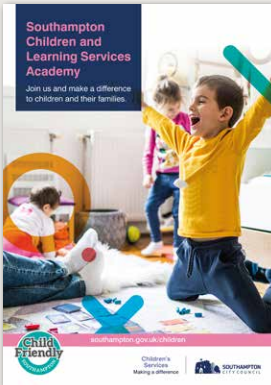
Pages from the Children's Services Academy brochure