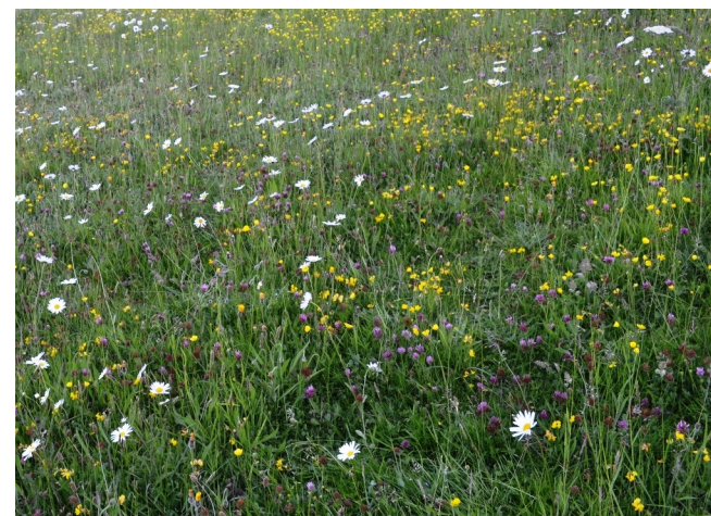
Low growing perennial meadow mix for banks.