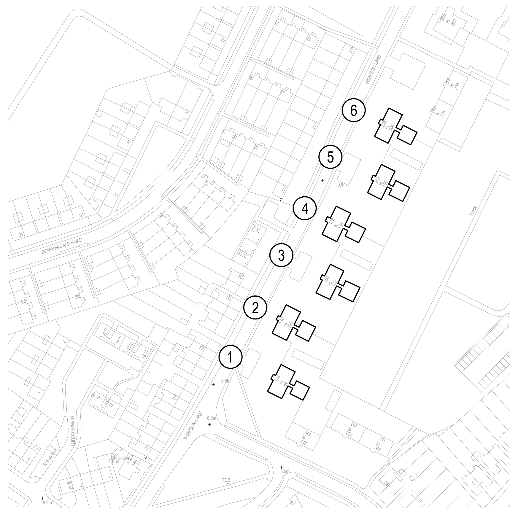
AREA: WIMPSON LANE, MILLBROOK