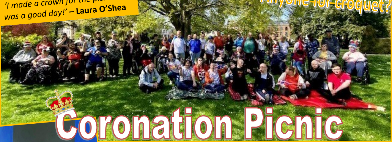
Anyone for croquet?