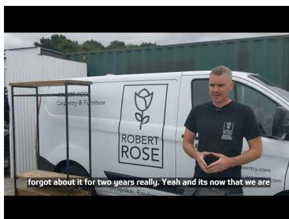
In this video, Robert Rose Carpentry talk about how they work with the Employment Support Team