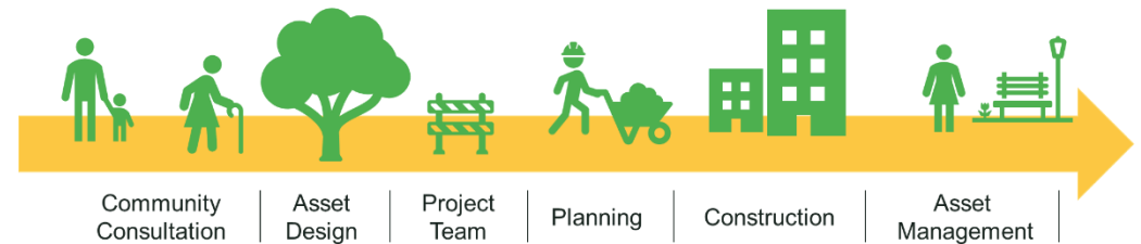
Figure 1: Social value is the golden thread to maximising benefits throughout the lifecycle of a development.

The Social Value Strategy is the golden thread to maximising benefits throughout the lifecycle of the development